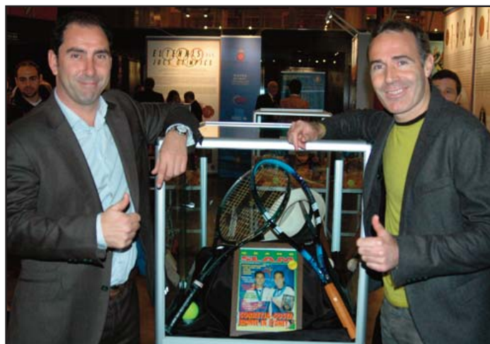
Photo: Organisers at the exhibition launch, Albert Costa and Alex Corretja with their Olympic memorabilia.