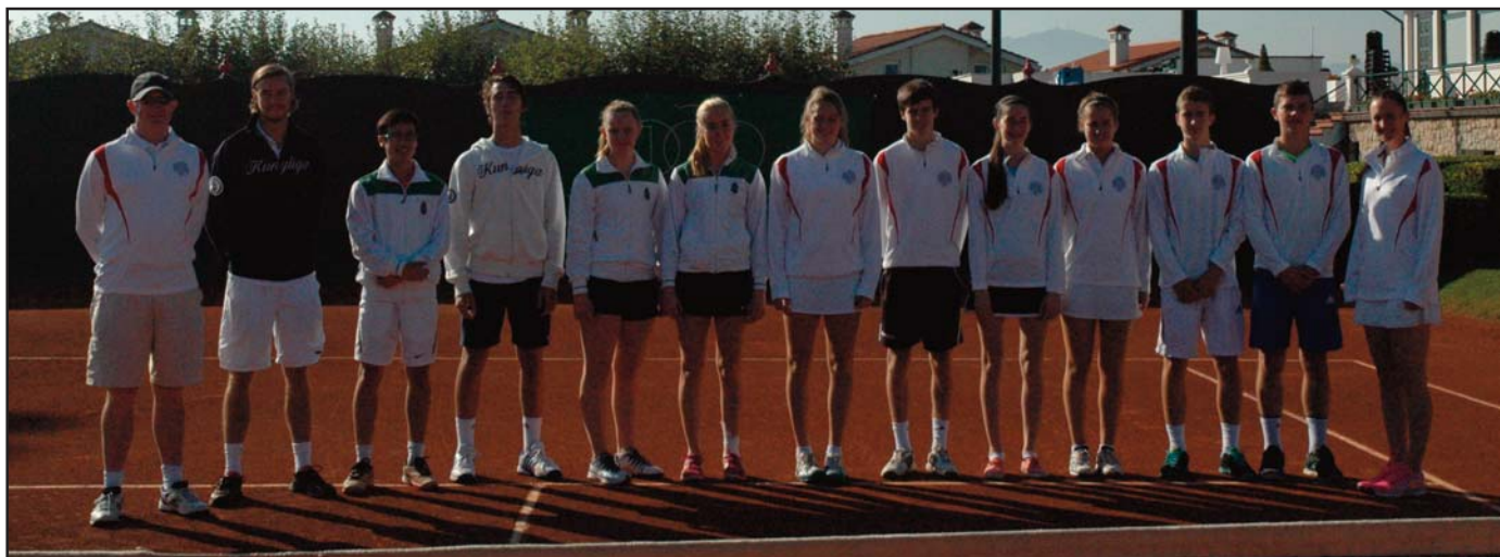
Photos: (Above) Players and coaches at the Fitzwilliam Cup, (Below) Players at the Rot-Weiss Berlin Cup