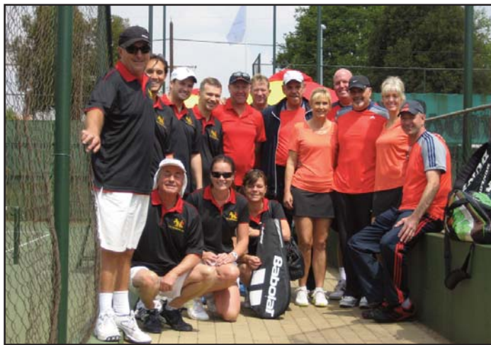
Photos: (Left) Players at Delhi Gymkhana, (right) The South Africa Challenge