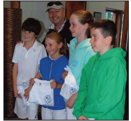
Photos: (Above) Events in Prague (left) and Carrickmines (right). Below, the U14 RCTB Cup