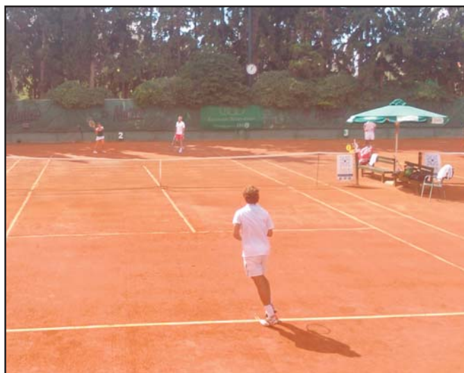
Photos: Players at Lyon, action in Athens