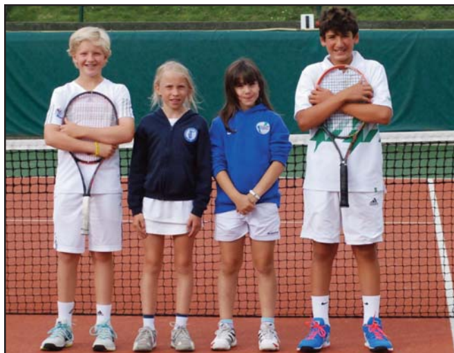
Photo: the U12s at Carrickmines.

The following clubs participated in this year's tournament: Carrickmines (Dublin), Cumberland LTC (London), RCT Barcelona, Real Club de Polo (Barcelona), I.Cesky (Prague, RC Magdalena (Santander). There was a new format this year, with each team playing a first round match seeded on last year's results. This determined who played in the cup and plate sections with Carrickmines winning overall and RC Magdalena winning the Shield.