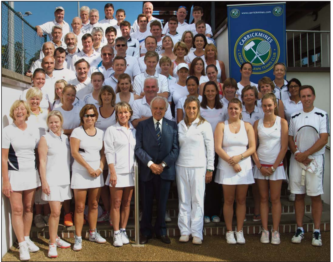
Photo: All dressed in white for the UK/Ireland Day at Carrickmines