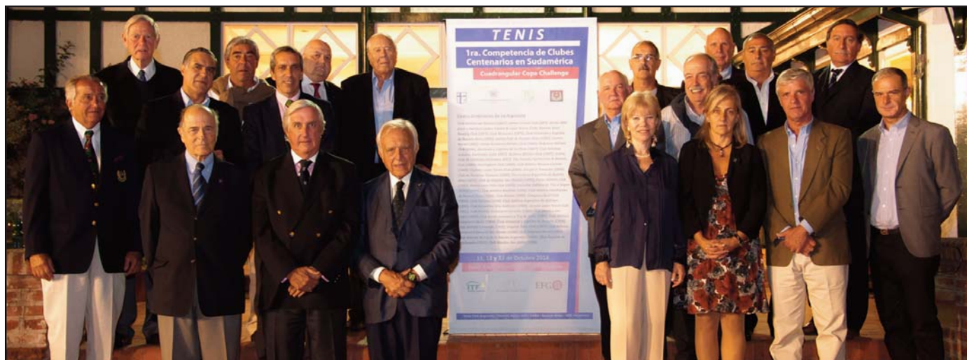
Photo: The Presidents of the Centenary Tennis Clubs in Argentina and other dignitaries.

We can clearly read on the plate that this was the place where the first sanctioned tournaments not only of tennis, but also of cricket and soccer took place. This is the way history goes.