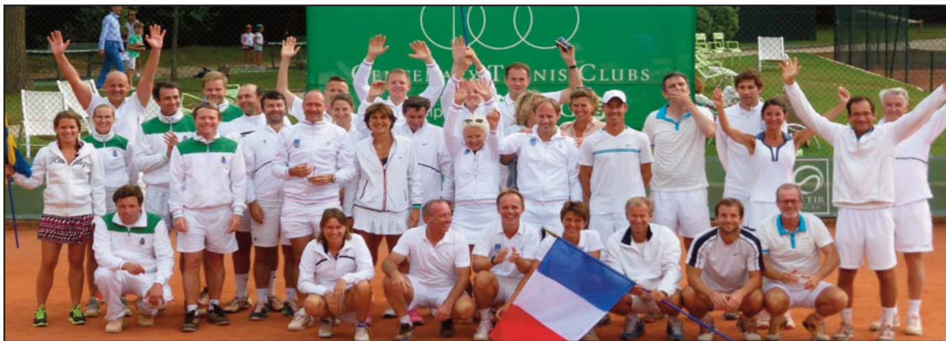
Photo: The Seniors event in Le Tir

The event was played in a great atmosphere between all four teams during the whole week-end with a competitive spirit blended with friendship, laughs and fair-play. After such 2 days, the teams were left hoping that the next CTC week-end will take place very soon.